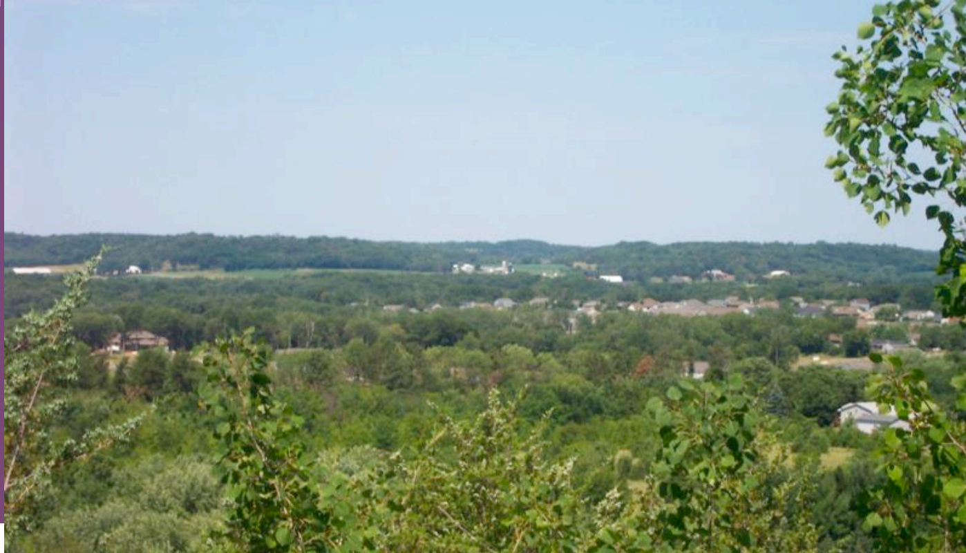
View of the South Ridge Park