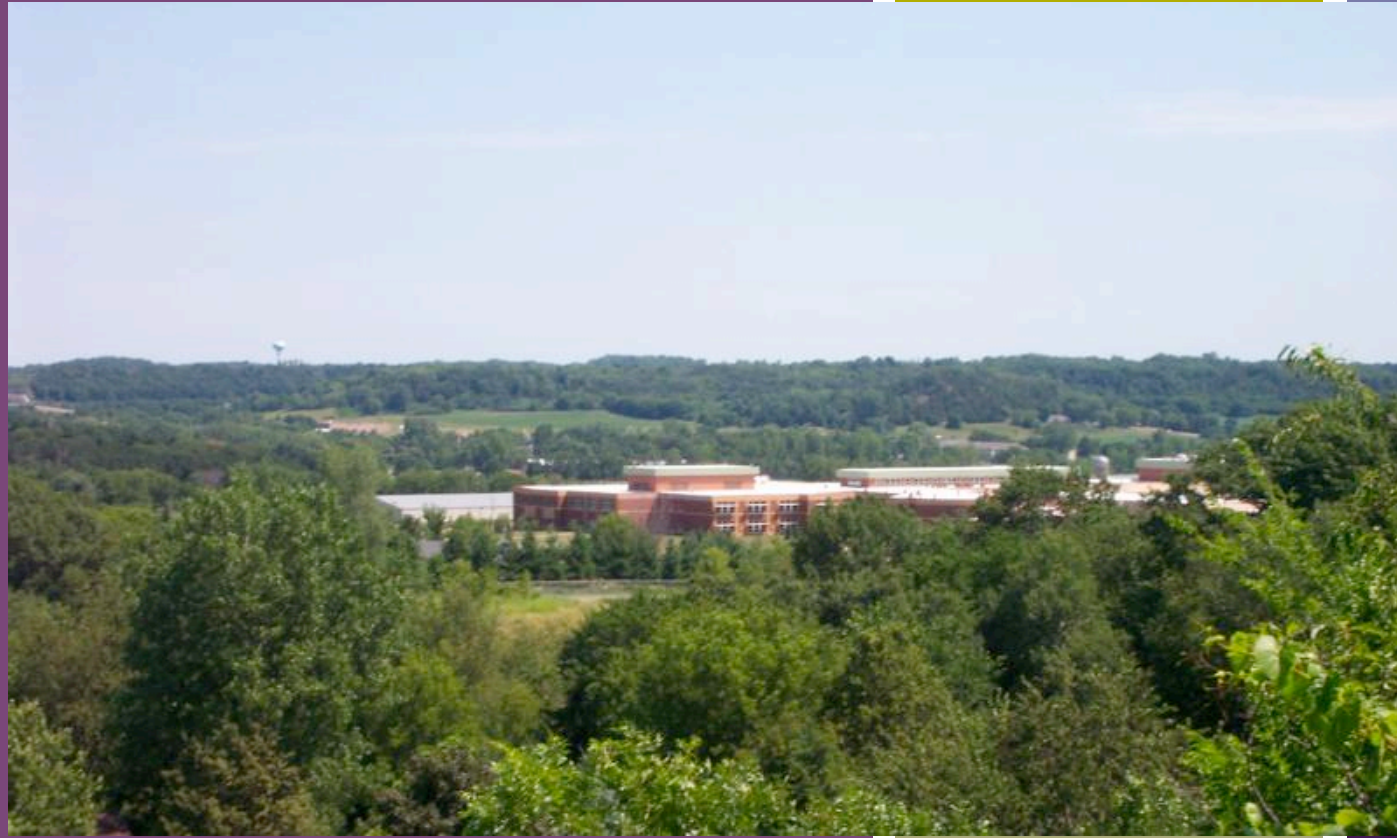
View of the River Falls High School from the park